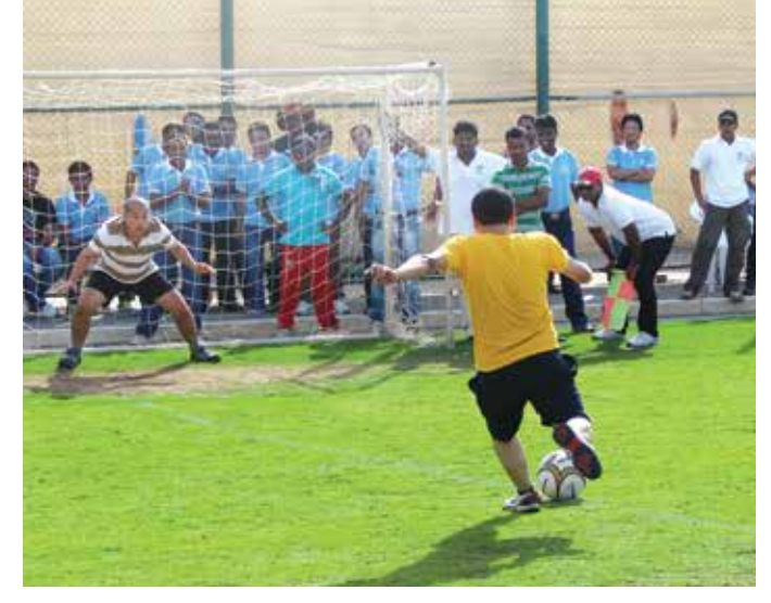
Sports Day Sports Day